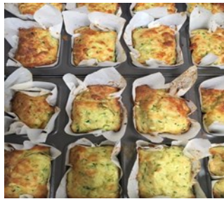
Homemade Zucchini Bakes